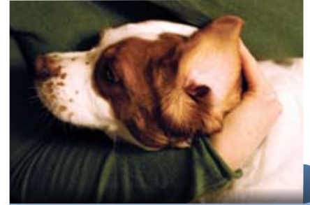
Use one hand to hold the ear flap back so that you can treat the ear with the other.